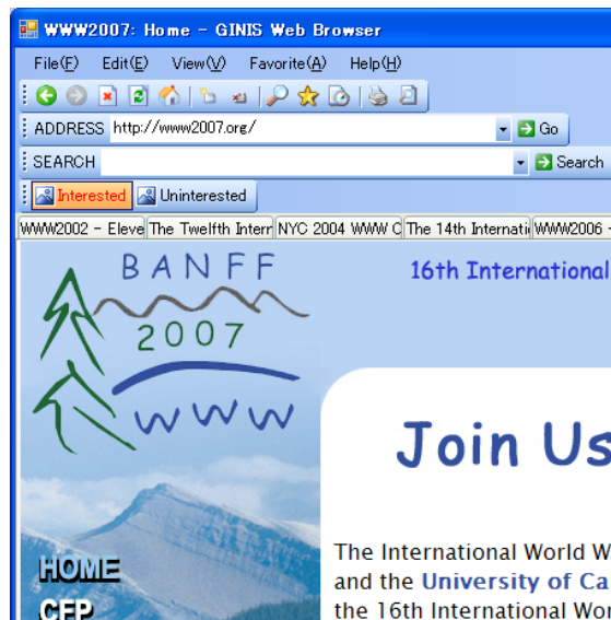
Figure 2. GINIS Browser User Interface

The GINIS Framework consists of 4 main modules: a client interface to detect and log user behavior (the browser), a database to store the user log information (the Logger), a learning engine (the Learner) and a prediction engine (the Predictor).